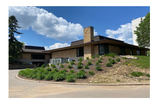
1080 Montreal Ave., St Paul

Neighborhood House was founded in 1897 by women of Mount Zion Temple struggling to create safe haven for Jewish refugees fleeing persecution in Russia. Today it serves over 16,000 people at two locations in St. Paul with a mission to provide hope, opportunity and dignity for all.